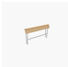
Landi leaning bench long