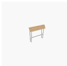
Landi leaning bench short