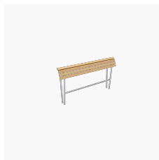
Landi leaning bench long